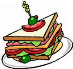
Delicious Club Sandwich